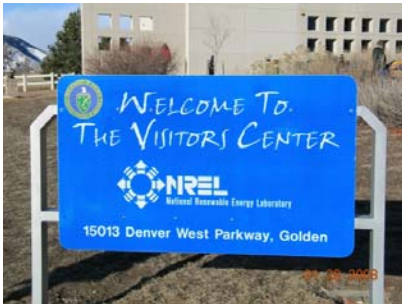
Conference tour welcome at NREL, National Renewable Energy Laboratory